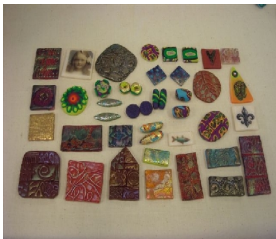
Ros's Textured Pieces