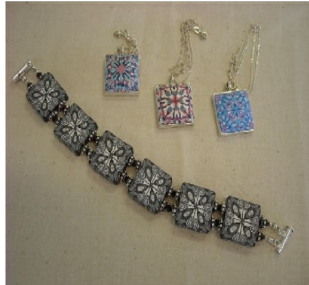
Alison's kaleidoscope pendants & Bracelet