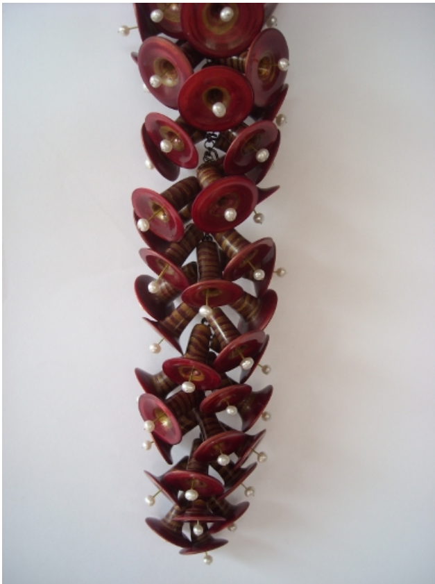
Christine's Blood River Sautoir