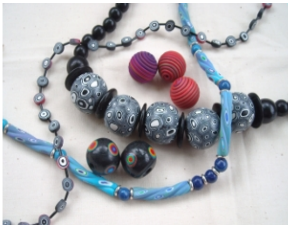
Carol's Extruded Beads