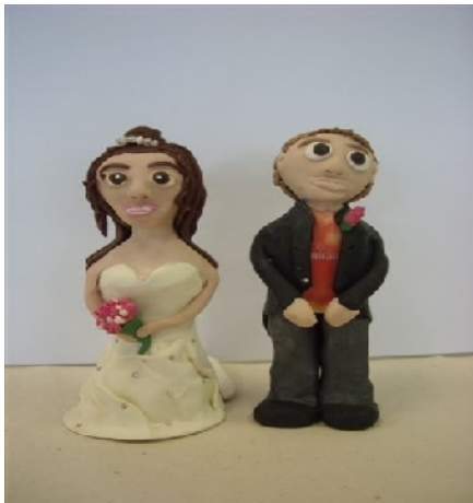
Gail's Wedding Characters

Remember to mark your diaries for the next clay day - Sunday 27th September . Till then, enjoy the summer and have fun playing.